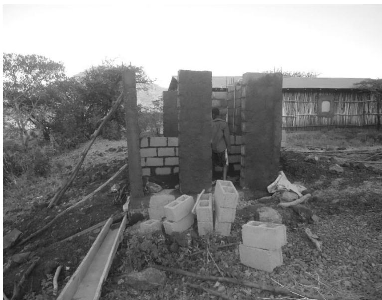
Construction water supply and toilet building

The contract between SCN and ORDA-Awura Amba ended December 2014. Based on the results it is expected that SCN will continue to provide modest support in 2015. Discussions are currently under way with ORDA (Mr Abebaw) and Awura Amba.