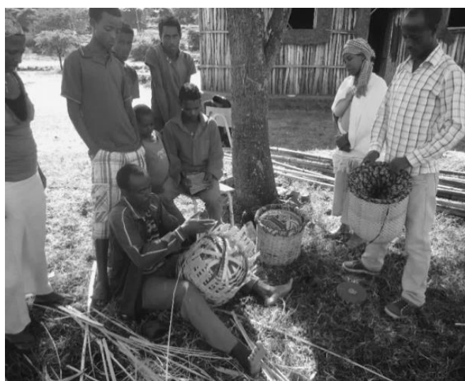
The making of a Hay basket

SCN would appreciate your support for a new renewable energy initiative for households €7,500