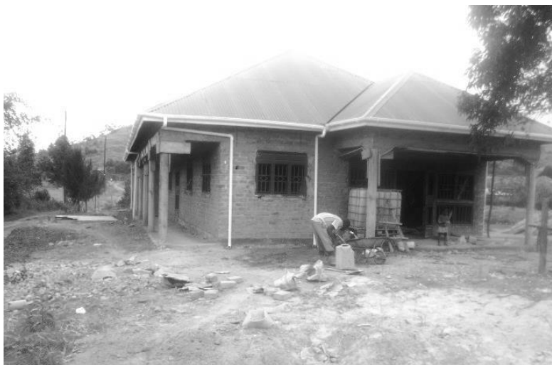
Construction and final result Renewable Energy Centre in Biharwe

Uganda, preferably in cooperation with like-minded NGOs. The ISC market in Uganda is growing steadily!