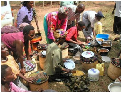
Cooking in Cookit and finishing in hay basket: information and training for women