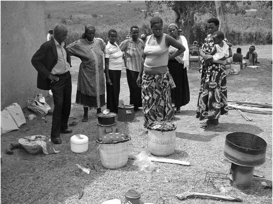
Instruction and Promotion, Mbarara

Beside ISSC product and user information as well as training, a production and distribution centre has been created where Solar CookKits, Water Pasteurisation Indicators (WAPIs), Rocket and Lorena Stoves and Hay Baskets are produced by its own staff, where materials and products are purchased and product quality is monitored very closely.