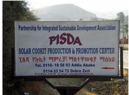
Partnership for Integrated Sustainable Development Association (PISDA Ethiopia)