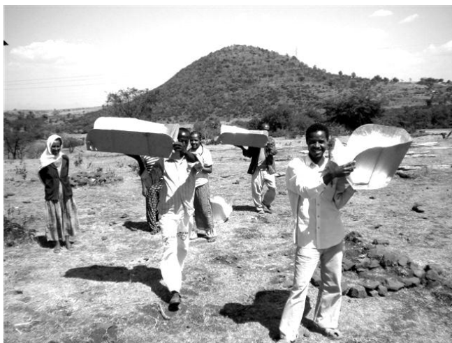
Men are happy as well with the advent of the CookKit!

In 2011 this will be an inherent part of all new ISSC projects.