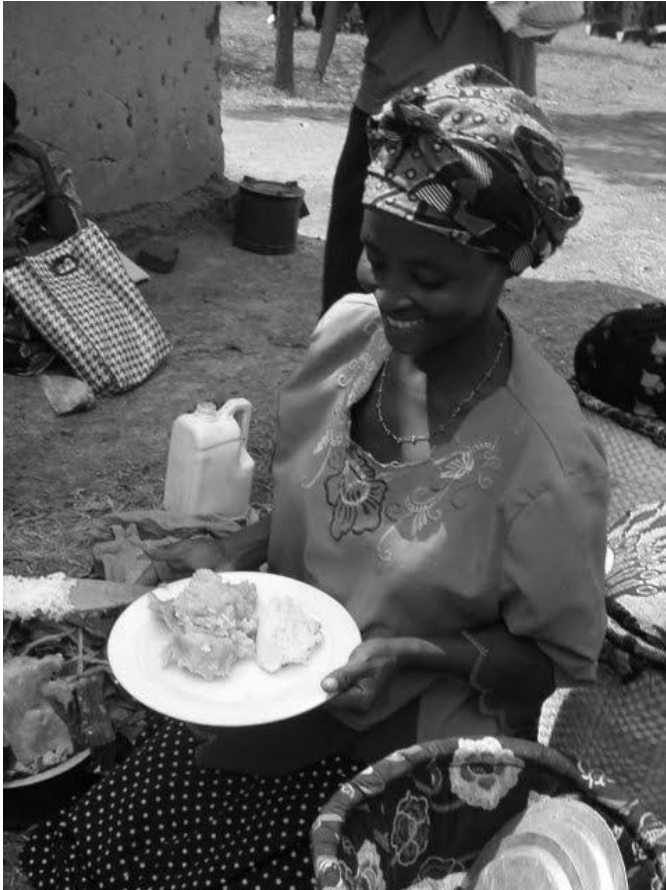
A Solar cooking meal

attention was paid with management to organisational and economic aspects, advice was given and concrete steps recommended, everything within the framework of the sustainable continuation of SCA activities. Further elaboration will take place in 2011.