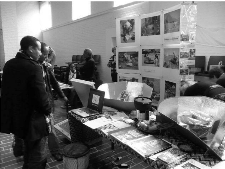
Ethiopia Day 2010

WINXXs Huizen continued to solve a number of computer and other ICT problems for management and work groups. In 2010, SCN representatives gave presentations at the Amsterdam International School, at the annual Ethiopia Day in Overvecht (see photo) and at the Soroptimist club in Hilversum.