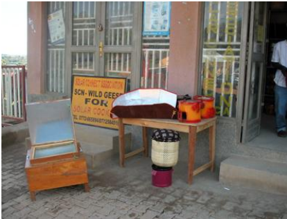
Solar Connect Association (Uganda) ISSC Shop in production and promotion centre