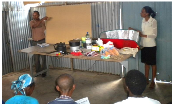
ISC information and promotion in Ethiopia

built in six provinces across Ethiopia. Production and distribution (sale) of solar, biogas and wood-saving cooking appliances started at the end of 2015. In 2014 and 2015 large-scale public promotion and training of local employees took place.