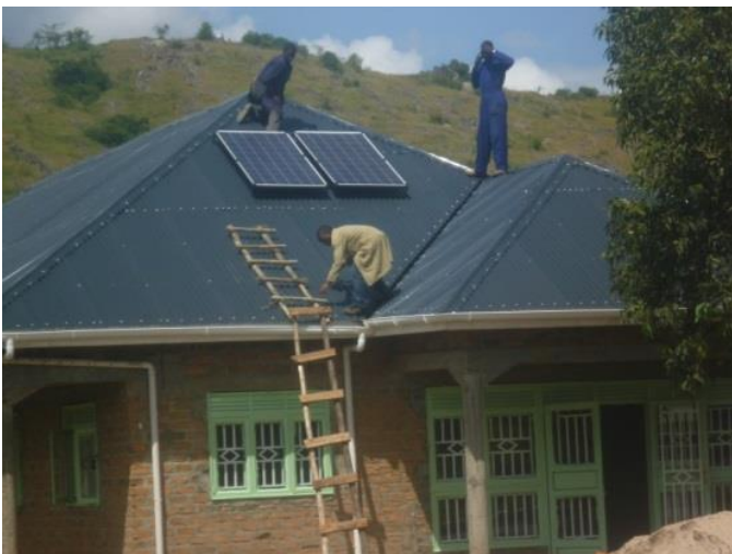
The new Renewable Energy Centre near Mbarara

Mid-2013 a business plan was decided on, including a schedule of ISC activities during the following five years. In the course of 2014 it became clear that the objective of financial independence had been achieved. The business expanded from Mbarara in the South West to the poorer outskirts of and villages around Kampala. For the time being production continues in Mbarara only. In 2014 construction of a Renewable Energy Centre with larger ISC production, training and distribution facilities was started with financial support from Wilde Ganzen and SCN. In its beautiful location on the main road between Uganda, The Congo, Tanzania and Rwanda, the building, fitted out with solar panels, is ready to continue and expand its activities. In short, SCA is the owner of a social Solar Cooking business for the production, marketing and sale of solar and other energy-saving cooking appliances.