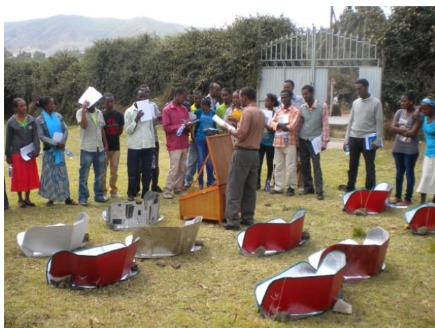
Solar cooking training session in Ethiopia

For the Solar Cooking KoZon Foundation's complete Vision and Objectives, see our website www.solarcookingkozon.nl