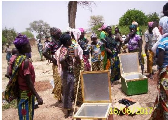
Interest in the cooking appliances is great. But the women still need to get used to this new way of cooking.

The project in the Tanghin village has continued to progress steadily in 2017. The production team has started the production of CookKits and Solar Boxes and a number has been sold, in particular thanks to a spectacular official opening attended by local and regional authorities. But sales are not yet up to par. One way to explain this is that people have to get used to the idea of cooking with the sun. A lot of energy and time has been spent on information and demonstrations to show women and also men how it works and what the advantages of buying and using these products, may offer these households in Tanghin and vicinity.