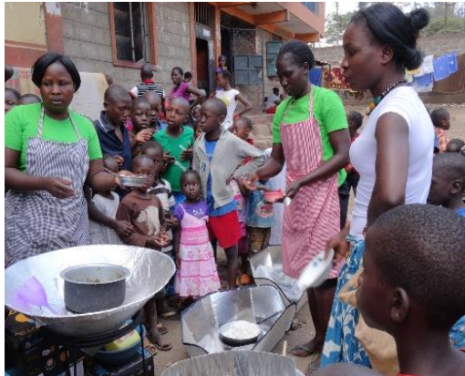
Great interest in solar cooking among young and old. Since the children learn it in school, they encourage their parents to start using solar cooking.

At the start he received a lot of support and advice from Bumala. Demonstrations are held at the Asulma Centre as well as in schools and markets in neighbouring areas of Nairobi. A number of colleagues and students participated as well. For example several students are allowed to take part in the ASULMA KOZON SOLAR COOKING CLUB and to use ISC to prepare lunches for the teachers. The experiences so far are comparable to those in Bumala.