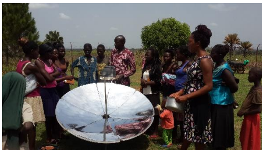
Parabolic Cooker demonstration in Gulu.

problems hampered its progress. To give this project a more powerful momentum, its 2018 follow-up includes complete independence accompanied by a franchise formula and an adapted approach plan.