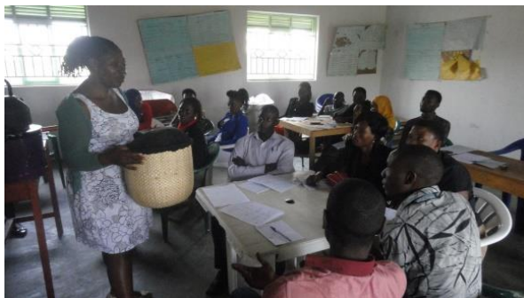
SCA staff during the in-company training.

The past year saw two important highlights. The first was the in-company training as described in the latest newsletter (no.3, December 2017). It is nice to see that this