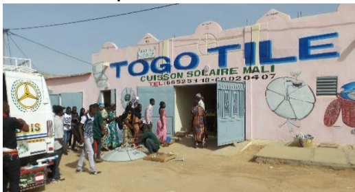
The new Togo-Tilé premises in Ségou, co-financed by Solar Cooking KoZon.

Togo Tilé is flourishing and is even bursting at the seams. Therefore, SCK decided end-2016 to participate in the financing of the construction of new business premises in Segou and in the purchase of a saw and welding machine, in cooperation with the government programme Programme d'Appui à la Croissance Économique et