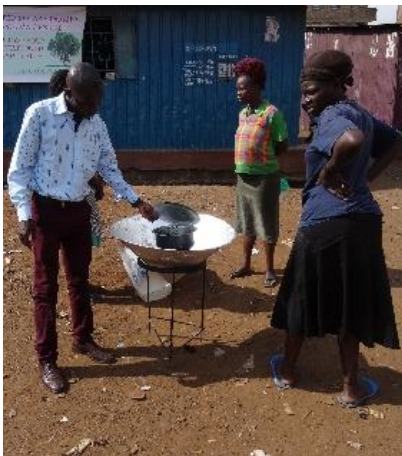
The conical solar cooker.