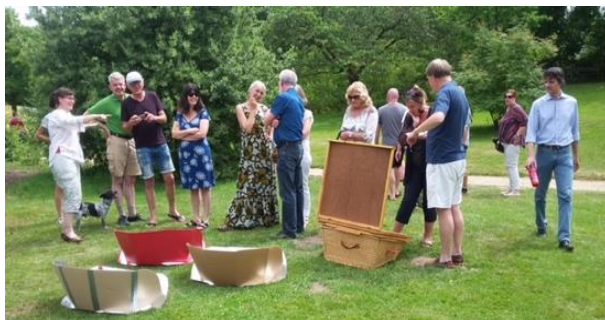
Visitors at the Belmondo Festival are looking with enthusiasm at the Solar Cooker demonstration.

This year too Solar Cooking KoZon was present at the Belmondo Festival in Wageningen. And it was a great success again. The weather was on our side so that we were able to demonstrate our homemade products. We used the Solar Box to bake cakes and the Solar Cooker to boil eggs. The hay basket enabled us to keep everything warm. In short: a great success! We thank everybody who contributed to this special day. Until next time.