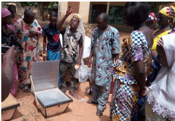
A student at the Lycée Technique in Sikasso, Mali explains solar cooking to a group of disabled people.

We wish to continue to enable the very poorest in Africa (such as refugees and disabled people) to use solar cooking. That is why we continue to subsidise projects in support of these groups. Our existing small ISC businesses supply the cooking appliances at a discount and they also take care of training. The women pay part of the cost price and Solar Cooking KoZon pays for the rest. In 2016 and 2017 this involved a project in the Nakivale refugee camp in Uganda and a project of the organisation of disabled people FERAPH in Mali.