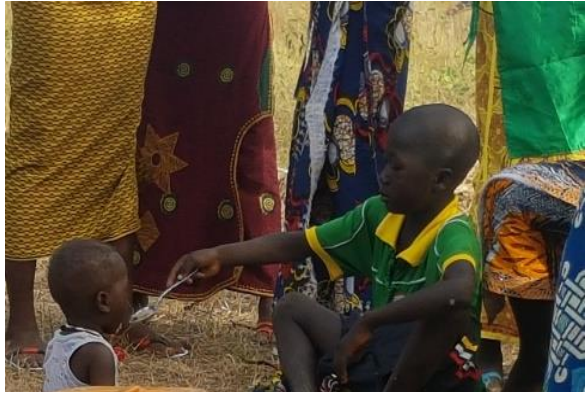
Even the little ones like the solar food.

The first project year showed a budget surplus because production lagged behind expectations. This amount will now be used for the second project year that has started in the meantime. The second year focuses first on further training of the project team in the manufacturing of integrated solar cooking (ISC) products. Improvement of production quality and learning how to make hay baskets and possibly WAPIs, are the main issues here.