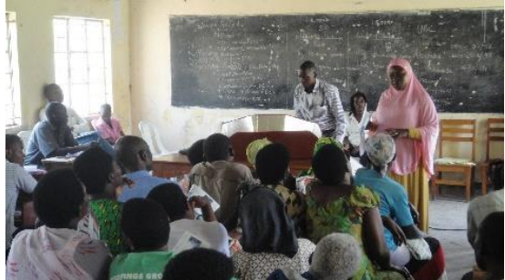
Solar cooking is explained to a number of inhabitants of the Nakivale refugee camp.