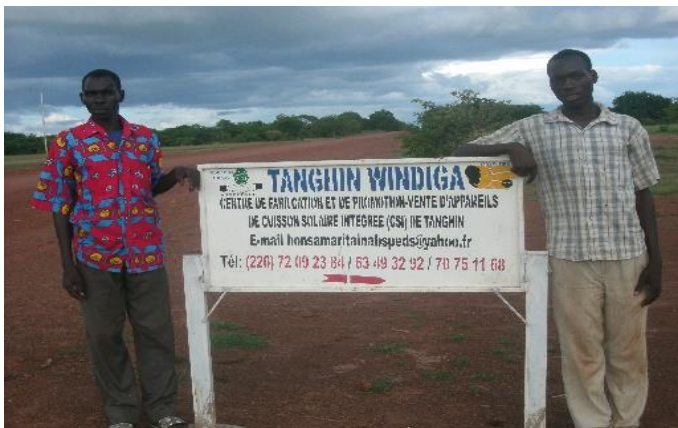
Two staff members next to the board with the name of the enterprise 'Tanghin Windiga'. The name means 'Sun of Tanghin'.

Other topics of attention are accounting and administration, and marketing and information techniques that will be strengthened as well. The inhabitants and the members of the project team still see the project as a great opportunity to develop the village as well as a serious possibility to work on the preservation of a viable environment. An environment where cooking with ISC products partly eliminates the use of firewood.