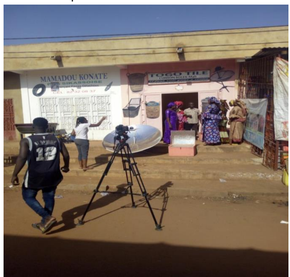
Footage for the documentary about Togo Tilé

SCK made no financial investments in Togo Tilé in 2019. Only funds for a documentary and an advertising spot were made available. Thus, we hope to inspire people in other African countries to establish solar cooking enterprises. The footage for the documentary is ready. We are now waiting for the final product.