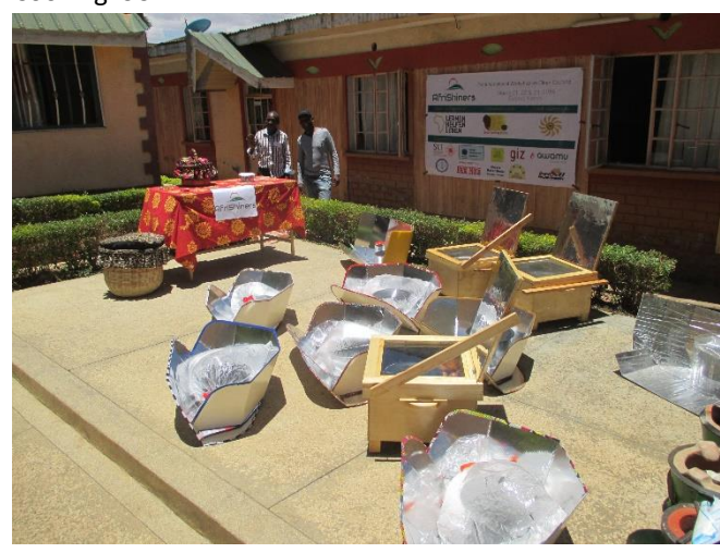
Afrishiners workshop 2019 in Eldoret, Kenya

small entrepreneurs or promotors of Integrated Solar Cooking ISC.