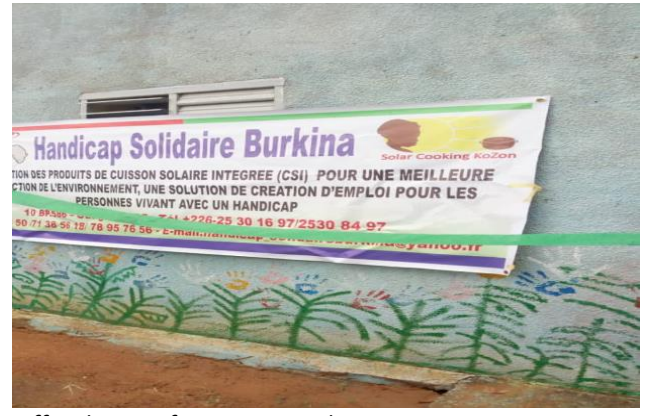
Official start of HSB project phase 2

Considering its recent start, HSB is quite active as far as marketing is concerned. HSB board members use the solar cooking products at home and in the office, thereby setting a good example. They also try to attend as many trade shows as possible to promote solar cooking products. Together with the other partner in Burkina Faso, le Bon Samaritain, they have created a consultative structure to enable the two organisations to advise each other about developments in their respective enterprises.