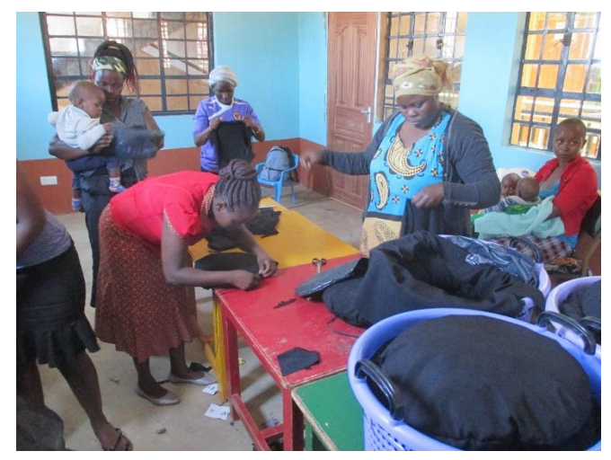
Production hay baskets in Shammah Centre

Didacus from FWAV took us on a field trip: on the back of the motorcycle, to visit solar cooker users. We saw a woman who has been using her first CooKit for many years but whose husband sticks to the old cooking habits, on a 3-stone fire, to prepare corn porridge in the traditional way. In Asulma and Shammah we were shown how their assistants make their own hay baskets.